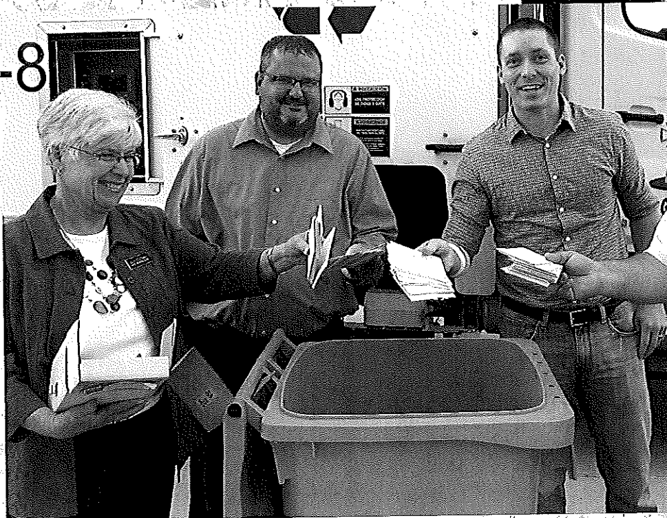
Shredding paper voter registration records